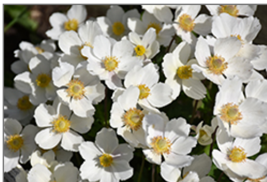
Windflower flowers