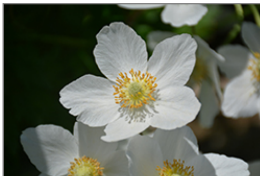
Windflower flowers

Windflower is recommended for the following landscape applications;