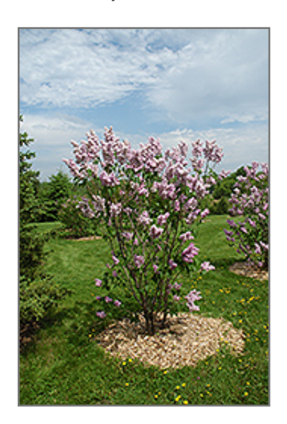
Montaigne Lilac in bloom