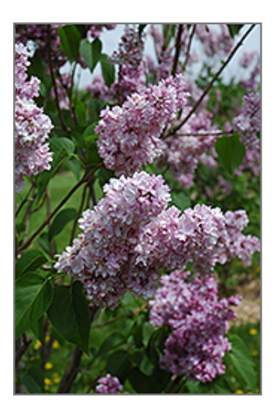
Montaigne Lilac flowers

Montaigne Lilac is recommended for the following landscape applications;