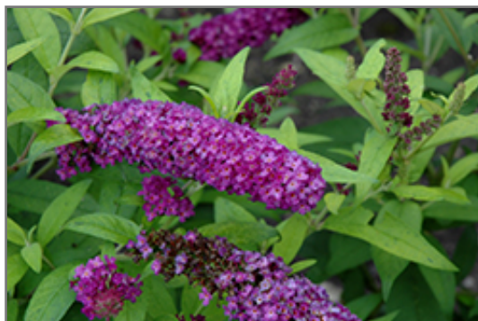
Monarch Crown Jewels Butterfly Bush flowers