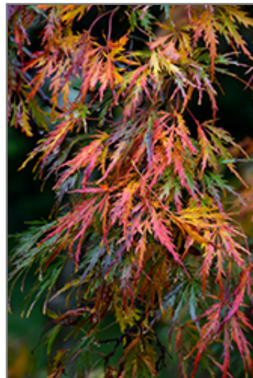
Cutleaf Japanese Maple in fall

Cutleaf Japanese Maple makes a fine choice for the outdoor landscape, but it is also well-suited for use in outdoor pots and containers. Because of its height, it is often used as a 'thriller' in the 'spiller-thriller-filler' container combination; plant it near the center of the pot, surrounded by smaller plants and those that spill over the edges. It is even sizeable enough that it can be grown alone in a suitable container. Note that when grown in a container, it may not perform exactly as indicated on the tag - this is to be expected. Also note that when growing plants in outdoor containers and baskets, they may require more frequent waterings than they would in the yard or garden.