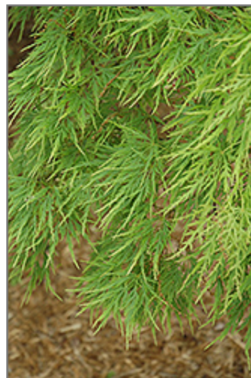
Cutleaf Japanese Maple foliage