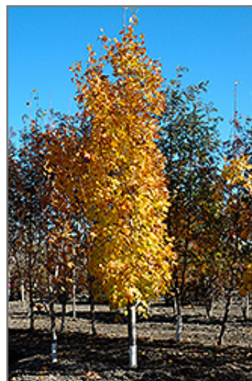
Lord Selkirk Sugar Maple in fall