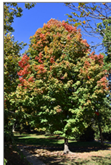
Endowment Sugar Maple