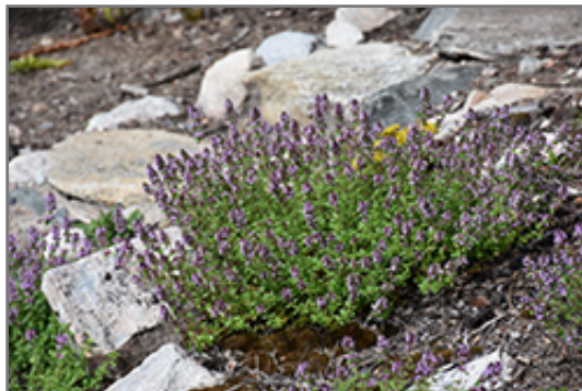
Lemon Thyme in bloom

This plant is quite ornamental as well as edible, and is as much at home in a landscape or flower garden as it is in a designated herb garden. It should only be grown in full sunlight. It prefers to grow in average to dry locations, and dislikes excessive moisture. It is considered to be drought-tolerant, and thus makes an ideal choice for a low-water garden or xeriscape application. It is not particular as to soil type or pH. It is highly tolerant of urban pollution and will even thrive in inner city environments. Consider covering it with a thick layer of mulch in winter to protect it in exposed locations or colder microclimates. This particular variety is an interspecific hybrid. It can be propagated by division; however, as a cultivated variety, be aware that it may be subject to certain restrictions or prohibitions on propagation.