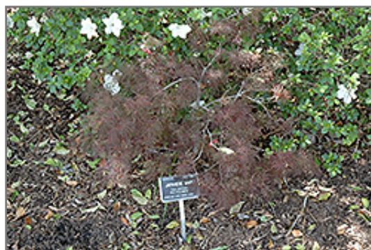
Red Feathers Japanese Maple