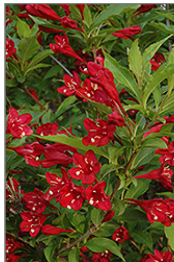
Red Prince Weigela flowers