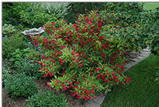
Red Prince Weigela in bloom