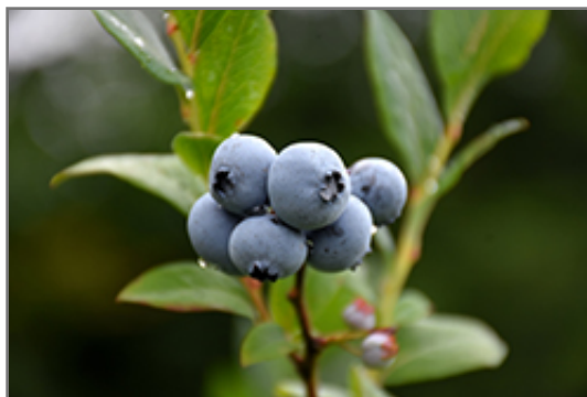
Northsky Blueberry fruit

Northsky Blueberry features dainty clusters of white bell-shaped flowers with shell pink overtones hanging below the branches in mid spring. It has green deciduous foliage. The glossy oval leaves turn an outstanding scarlet in the fall. It features an abundance of magnificent blue berries in mid summer.