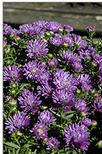
Blue Henry Aster flowers