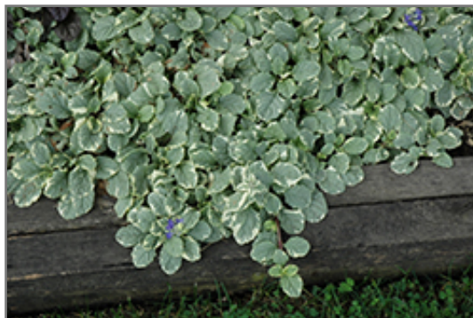
Silver Queen Bugleweed