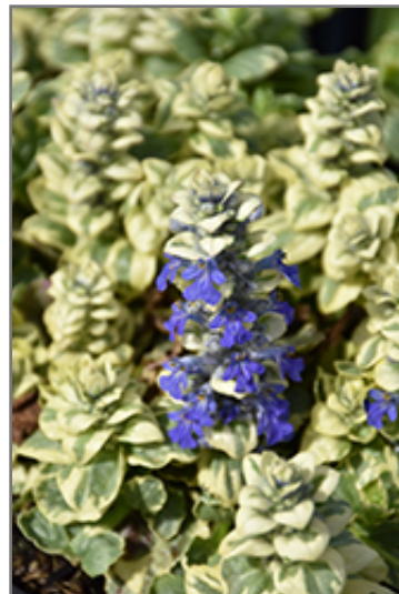
Silver Queen Bugleweed flowers