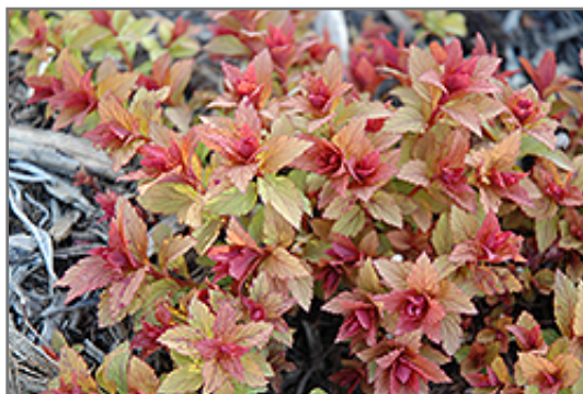
Magic Carpet Spirea foliage