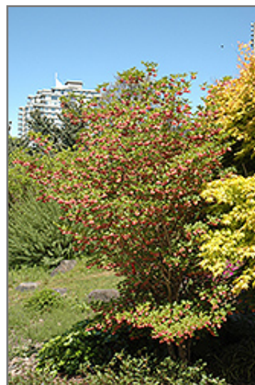
Redvein Enkianthus in bloom