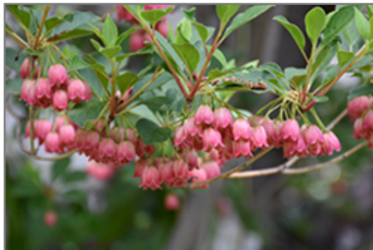
Redvein Enkianthus flowers