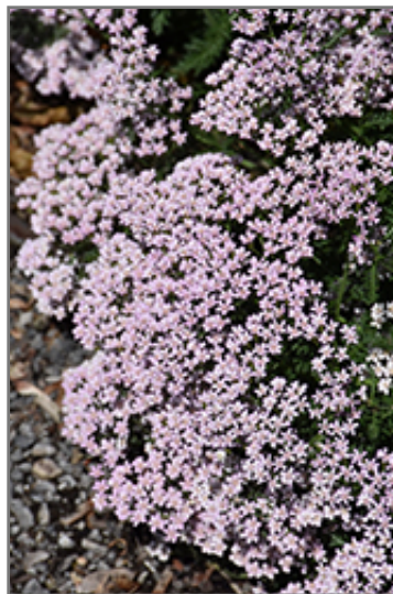
Lavender Deb Yarrow flowers