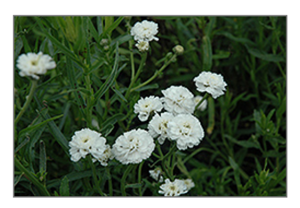
Noblessa Achillea flowers

Masses of double white blossoms fill the plants for the entire summer; low maintenance and easy to grow; a great addition to the garden or containers