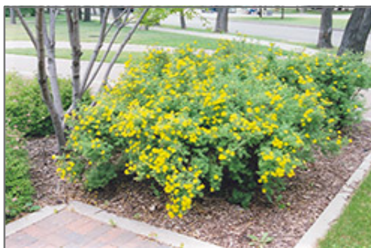
Coronation Triumph Potentilla in bloom