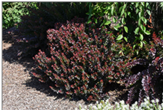
Midnight Ruby Barberry