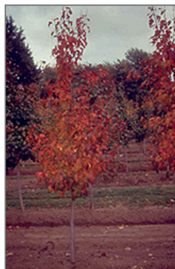
Beethoven Amur Maple in fall