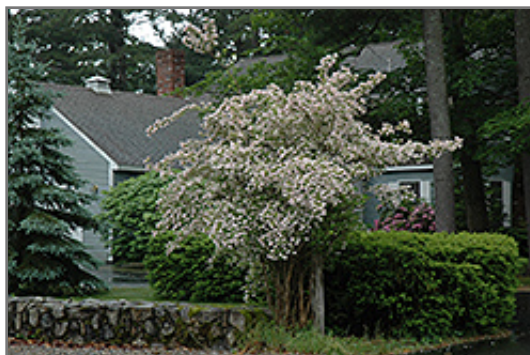
Pink Cloud Beautybush in bloom

Pink Cloud Beautybush will grow to be about 8 feet tall at maturity, with a spread of 6 feet. It tends to be a little leggy, with a typical clearance of 3 feet from the ground, and is suitable for planting under power lines. It grows at a fast rate, and under ideal conditions can be expected to live for approximately 30 years.