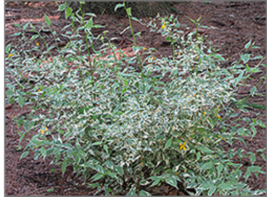
Picta Japanese Kerria

This shrub performs well in both full sun and full shade. It does best in average to evenly moist conditions, but will not tolerate standing water. It is not particular as to soil type or pH. It is highly tolerant of urban pollution and will even thrive in inner city environments. This is a selected variety of a species not originally from North America.