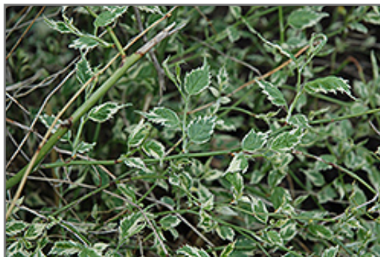
Picta Japanese Kerria foliage