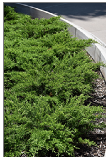
Broadmoor Juniper

Broadmoor Juniper will grow to be about 24 inches tall at maturity, with a spread of 8 feet. It tends to fill out right to the ground and therefore doesn't necessarily require facer plants in front. It grows at a slow rate, and under ideal conditions can be expected to live for approximately 30 years.