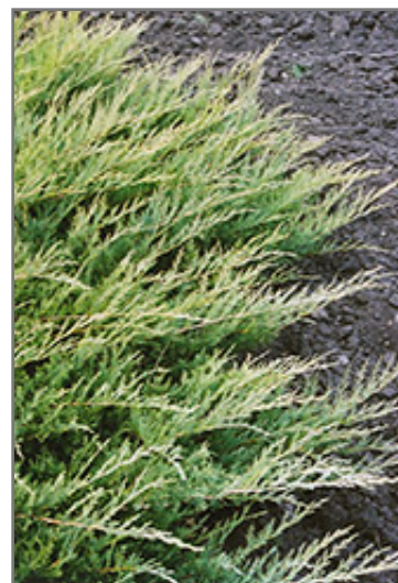
Broadmoor Juniper foliage