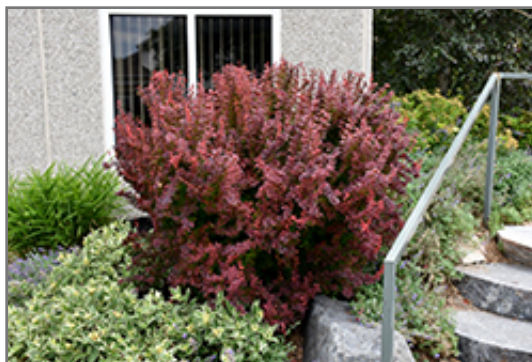
Orange Rocket Japanese Barberry