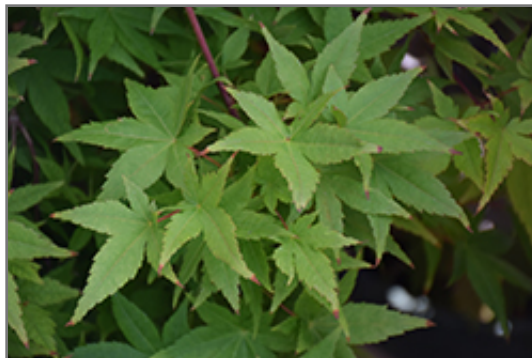
Ryusen Japanese Maple foliage