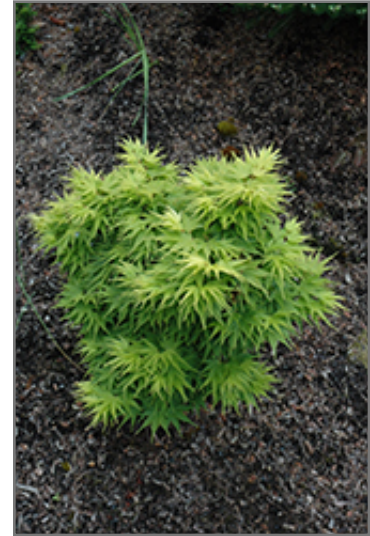
Mikawa Yatsubusa Japanese Maple

Mikawa Yatsubusa Japanese Maple is a fine choice for the yard, but it is also a good selection for planting in outdoor pots and containers. With its upright habit of growth, it is best suited for use as a 'thriller' in the 'spiller-thriller-filler' container combination; plant it near the center of the pot, surrounded by smaller plants and those that spill over the edges. It is even sizeable enough that it can be grown alone in a suitable container. Note that when grown in a container, it may not perform exactly as indicated on the tag - this is to be expected. Also note that when growing plants in outdoor containers and baskets, they may require more frequent waterings than they would in the yard or garden.