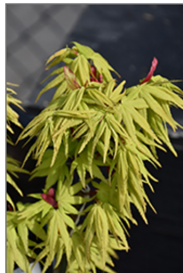
Mikawa Yatsubusa Japanese Maple foliage