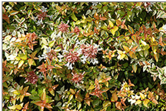
Kaleidoscope Abelia flowers

Kaleidoscope Abelia is recommended for the following landscape applications;