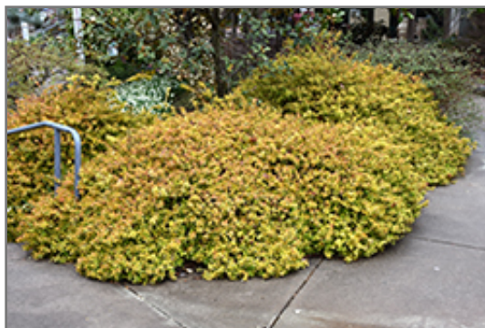
Kaleidoscope Abelia

Kaleidoscope Abelia makes a fine choice for the outdoor landscape, but it is also well-suited for use in outdoor pots and containers. It can be used either as 'filler' or as a 'thriller' in the 'spiller-thriller-filler' container combination, depending on the height and form of the other plants used in the container planting. It is even sizeable enough that it can be grown alone in a suitable container. Note that when grown in a container, it may not perform exactly as indicated on the tag - this is to be expected. Also note that when growing plants in outdoor containers and baskets, they may require more frequent waterings than they would in the yard or garden. Be aware that in our climate, this plant may be too tender to survive the winter if left outdoors in a container. Contact our experts for more information on how to protect it over the winter months.