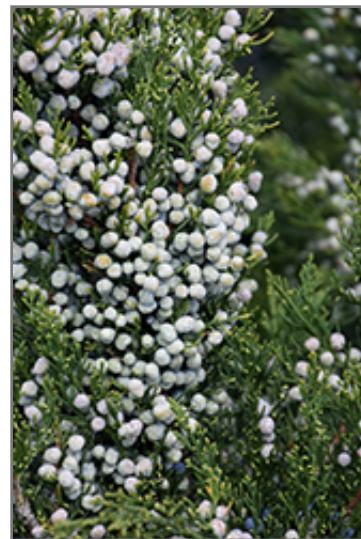
Fairview Juniper fruit