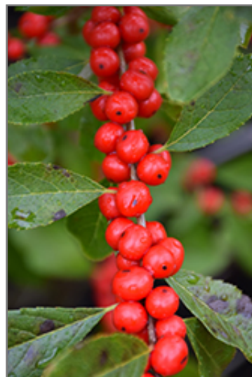
Red Sprite Winterberry fruit

Red Sprite Winterberry is recommended for the following landscape applications;