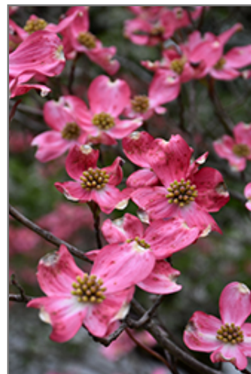
Cherokee Chief Flowering Dogwood flowers