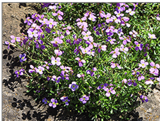
Dwarf Rock Cress in bloom