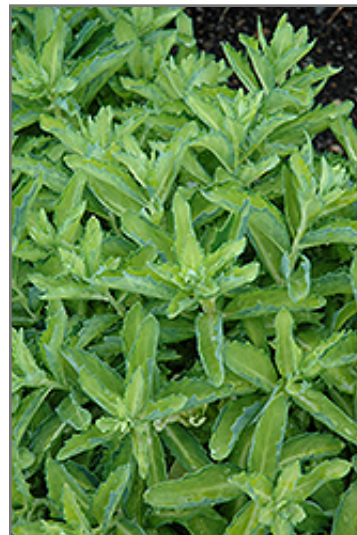
Autumn Delight Stonecrop foliage

Autumn Delight Stonecrop is a fine choice for the garden, but it is also a good selection for planting in outdoor pots and containers. It is often used as a 'filler' in the 'spiller-thriller-filler' container combination, providing a mass of flowers and foliage against which the larger thriller plants stand out. Note that when growing plants in outdoor containers and baskets, they may require more frequent waterings than they would in the yard or garden.