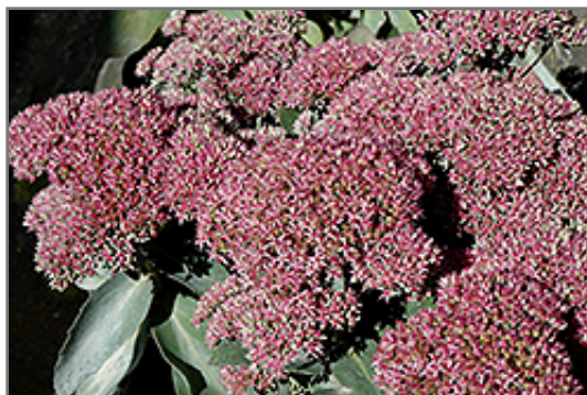
Autumn Delight Stonecrop flowers

This is a relatively low maintenance plant, and is best cleaned up in early spring before it resumes active growth for the season. It is a good choice for attracting butterflies to your yard, but is not particularly attractive to deer who tend to leave it alone in favor of tastier treats. It has no significant negative characteristics.