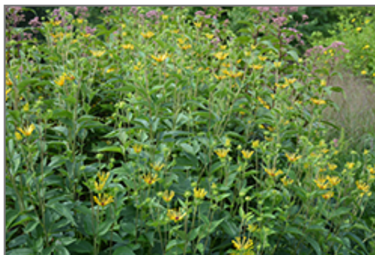
Henry Eilers Sweet Coneflower in bloom