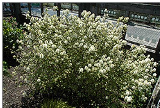
Mt. Airy Fothergilla in bloom