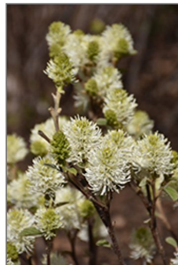
Mt. Airy Fothergilla flowers