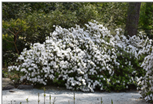
Delaware Valley White Azalea in bloom