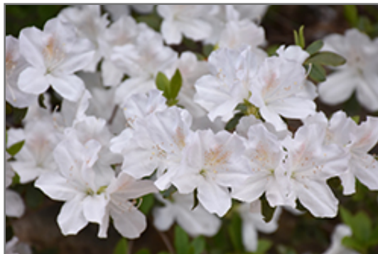
Delaware Valley White Azalea flowers