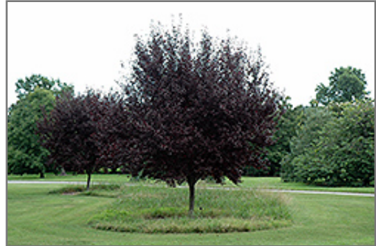
Krauter Vesuvius Plum

This tree should only be grown in full sunlight. It does best in average to evenly moist conditions, but will not tolerate standing water. It is not particular as to soil type or pH. It is highly tolerant of urban pollution and will even thrive in inner city environments. This is a selected variety of a species not originally from North America.