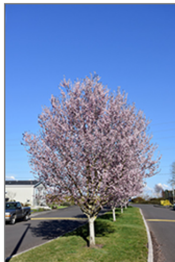
Krauter Vesuvius Plum in bloom