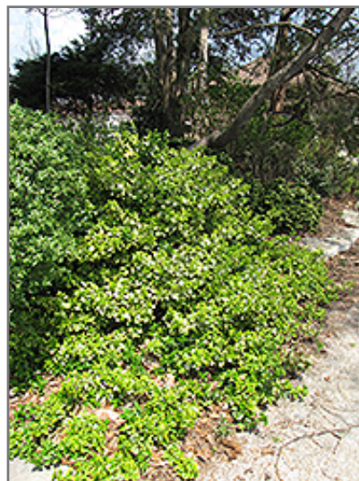
Emerald 'n' Gold Wintercreeper