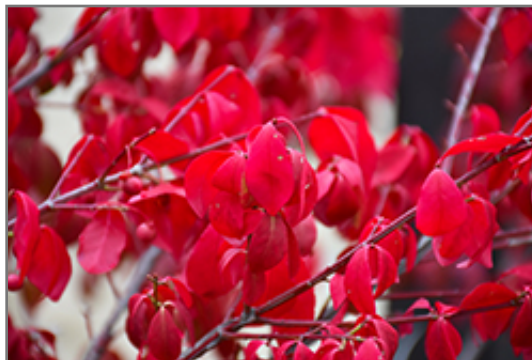
Rudy Haag Burning Bush in fall