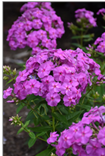
Flame Lilac Garden Phlox flowers