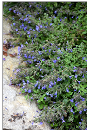
Kit Kat Catmint in bloom

Kit Kat Catmint is recommended for the following landscape applications;