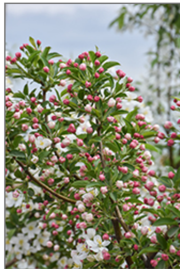
Firebird Flowering Crab flower buds