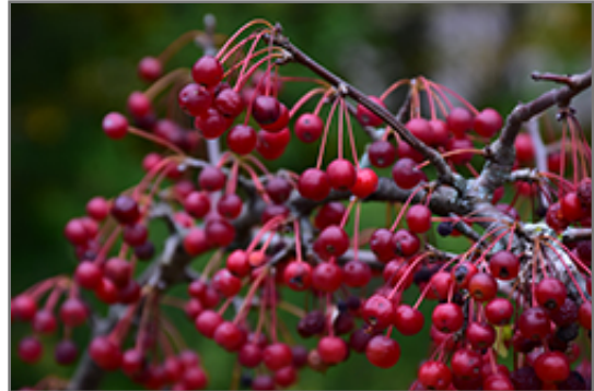
Firebird Flowering Crab fruit

* This is a 'special order' plant - contact store for details