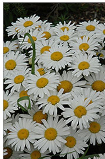
Snow Lady Shasta Daisy flowers