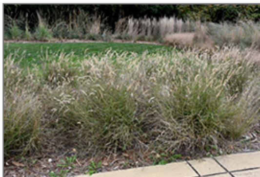
Karley Rose Oriental Fountain Grass fruit