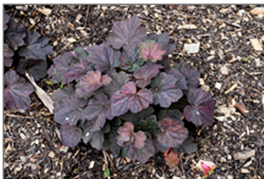
Mocha Coral Bells