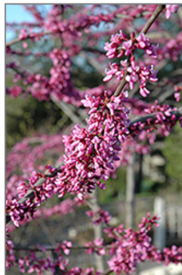
Northern Strain Redbud flowers

Northern Strain Redbud is recommended for the following landscape applications;