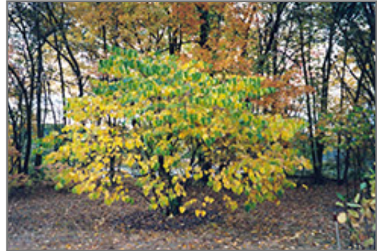
Northern Strain Redbud in fall

This tree does best in full sun to partial shade. It prefers to grow in average to moist conditions, and shouldn't be allowed to dry out. It is not particular as to soil type or pH. It is highly tolerant of urban pollution and will even thrive in inner city environments, and will benefit from being planted in a relatively sheltered location. Consider applying a thick mulch around the root zone in winter to protect it in exposed locations or colder microclimates. This is a selection of a native North American species.