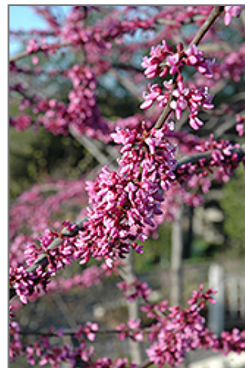
Northern Strain Redbud flowers

Northern Strain Redbud is recommended for the following landscape applications;