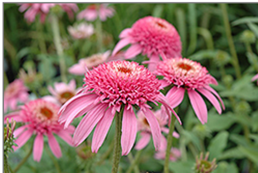
Cone-fections Pink Double Delight Coneflower flowers