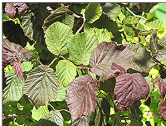
Red Majestic Corkscrew Hazelnut foliage