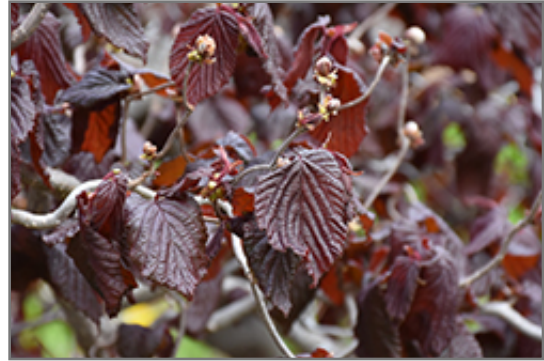
Red Majestic Corkscrew Hazelnut foliage

This shrub does best in full sun to partial shade. It is very adaptable to both dry and moist locations, and should do just fine under average home landscape conditions. It is not particular as to soil type or pH. It is highly tolerant of urban pollution and will even thrive in inner city environments. This is a selected variety of a species not originally from North America.