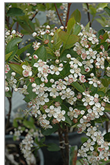
Viking Chokeberry flowers