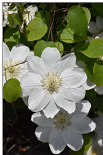
Guernsey Cream Clematis flowers