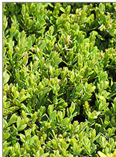
Compact Korean Boxwood foliage