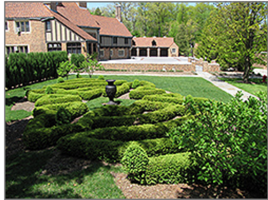
Compact Korean Boxwood

Compact Korean Boxwood makes a fine choice for the outdoor landscape, but it is also well-suited for use in outdoor pots and containers. It is often used as a 'filler' in the 'spiller-thriller-filler' container combination, providing the canvas against which the thriller plants stand out. Note that when grown in a container, it may not perform exactly as indicated on the tag - this is to be expected. Also note that when growing plants in outdoor containers and baskets, they may require more frequent waterings than they would in the yard or garden.