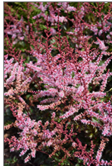
Delft Lace Astilbe flowers

Delft Lace Astilbe is recommended for the following landscape applications;